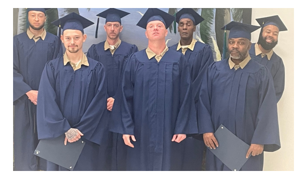
Alabama Therapeutic Educational Facility January 2023 Graduating Class

Recently, LBCR hosted its first CEI graduation where 16 participants successfully completed the 30-day vocational training program with 15 participants already hired by local unions. This was the first time the LBCR reentry program offered this in-house training for residents. Those in attendance at the graduation were GEO Reentry staff, family members, California Department of Corrections and Rehabilitation (CDCR) officials and trainers from CEI. The event was a celebration of the participants' hard work and accomplishments, as well as our new partnership with CEI. This new venture is adding value and aligning with our core values, while giving our residents an opportunity to change their behavior and change their lives.