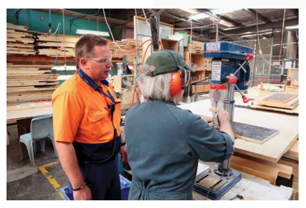
• • • GEO is committed to reducing recidivism rates through education and training.