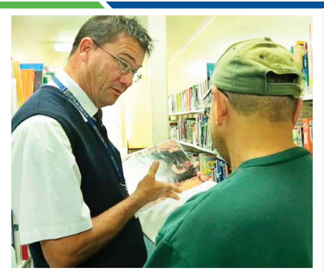
••• A new system at Fulham is setting high standards in prisoner case management.