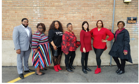
Chicago West Fulton RSC Team

All three Chicago area GEO RSCs are licensed by the Illinois Department of Human Services, Division of Substance Use, Prevention, and Recovery (SUPR), and offer substance abuse assessments and all levels of outpatient substance abuse treatment. The facilities also provide transportation assistance and actively collaborate with several other community service providers to address a variety of participant needs such as clothing, food, and medical/mental health/ dental care.