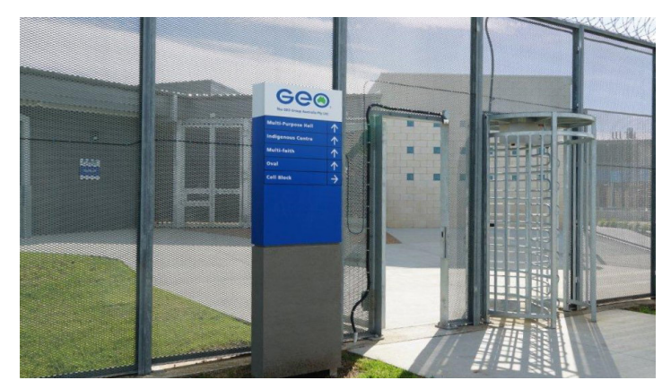
Entrance to Cultural Centre.