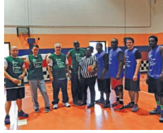
Heritage Trail Correctional Facility: HTCF basketball champions played the Warden's team, with staff on site to cheer them on. The event raised over $100 which was donated to St. Jude Children's Research Hospital.